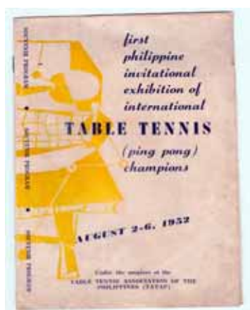
Figure 2 – Souvenir Program