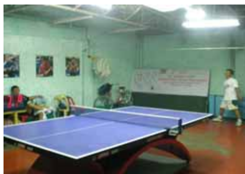
Figure 9 – The Venue