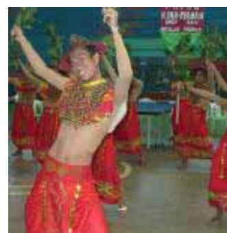
Figure 14 – Ping-pong Dance 2