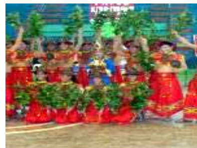
Figure 13 – Ping-pong Dance