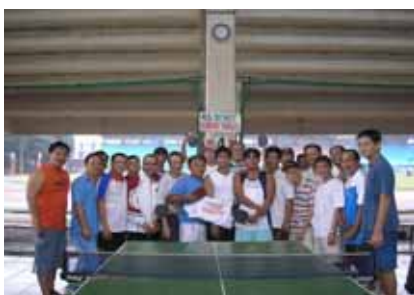
Figure 12 – Group picture of club members with the researchers