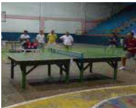
Figure 15 – “Lihadors” in action