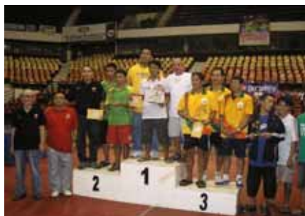
Figure 8 - Cebu City Team winning the Men's Team "Liha" Event