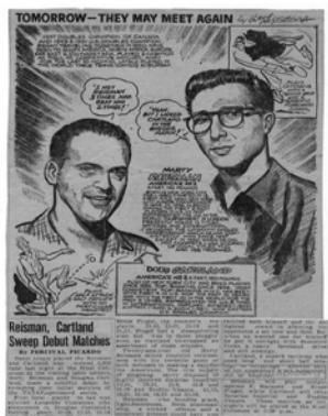
Figure 1 – Published Article during the 1 st Philippine Invitational of Champions in 1952

Reisman, Richard Bergman and Johnny Leach were invited to play in the 1 st Philippine Invitational of Champions in 1952 witnessed by at least 10,000 spectators in an arena as personally accounted for by Mr. Reisman during his Philippine visit. This was the first official international table tennis event organized in the Philippines. The figures below are some of the highlights of the said event.