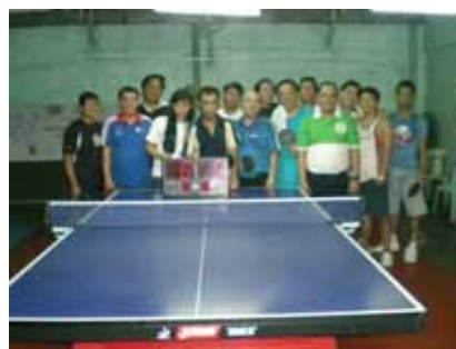
Figure 10 – Some of the club members with the researchers